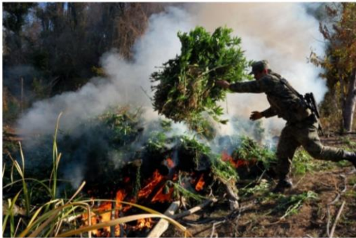
Bildestreit: Også forskere er utsatt i krigen mot narkotika. Her adlegger den medikalske haren en cannabisplantasje i År.